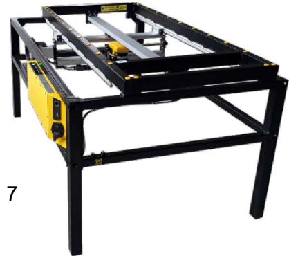
Magnus 5 and 7